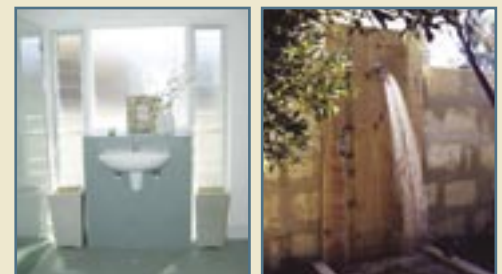
Left: The bathroom at Nautical Court. Right: outside shower at Le Froy Road.