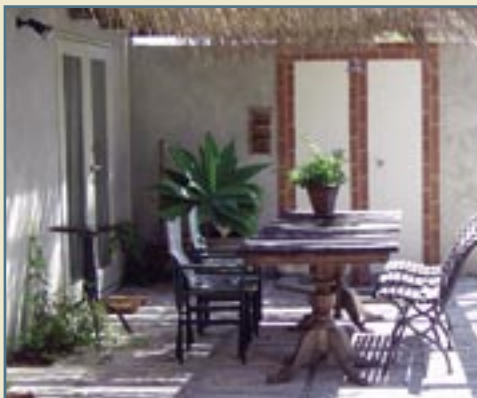
Outside terrace and shower at Nautical Court.

Judith made maximum use of light with patio and glass doors leading to the terrace from the bedrooms and living areas, while louvre windows allow the sea breeze to come in. So successful was Judith's transformation that she purchased a second home in Nautical Court and again applied her magical touch to a three bedroom brick and tile home. With an open plan kitchen, north facing courtyard, white washed floors, outdoor shower and an entertainer's dream terrace, the original home is barely recognisable.