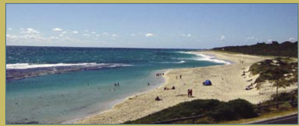
Beachside living: Enhancing the local environment is important to the Yanchep and Two Rocks residents.

A BIG hello from us all at Yanchep Sun City Pty Ltd.