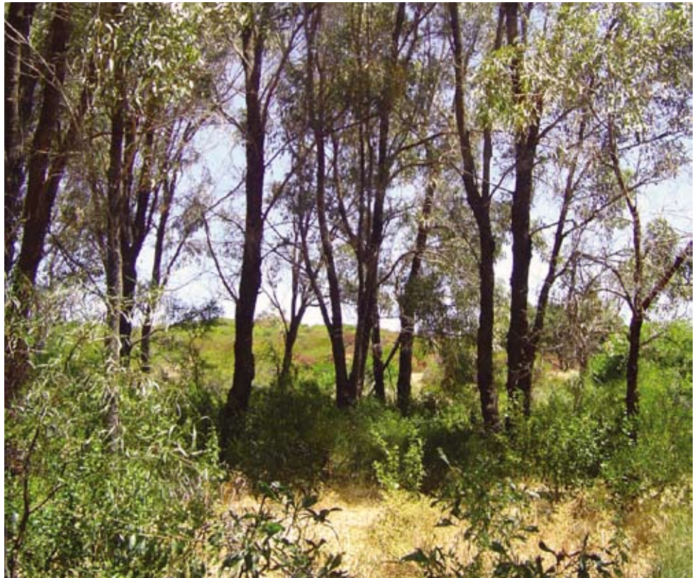
Capricorn developers will preserve many of the existing Tuart trees and dunal vegetation.

The preservation of the existing environment is also being achieved elsewhere in road reserves, in specific low density housing precincts and by retaining the natural ridgelines and dunal formations to provide strong east-west links through the development connecting to the coast. The natural beauty of the area will be further