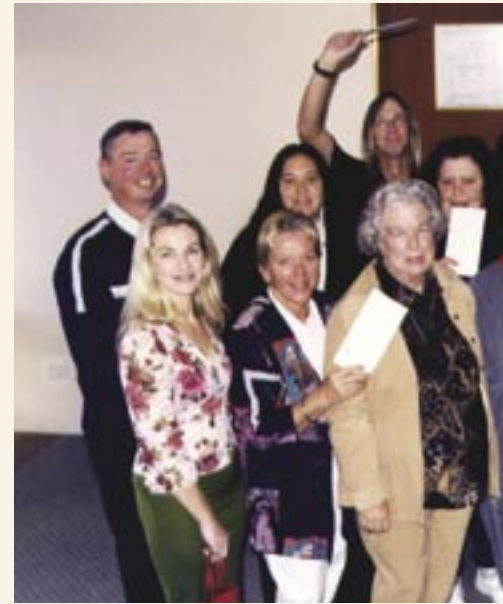
Successful sponsorships: Previous successful

"It's an innovative technique that will improve pedestrian safety and preserve the village atmosphere," he said.