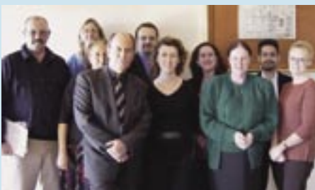
The Community Reference Group

YANCHEP Sun City Pty Ltd (YSC) recently established a Community Reference Group to help develop a Community Development Plan for Capricorn Coastal Village.