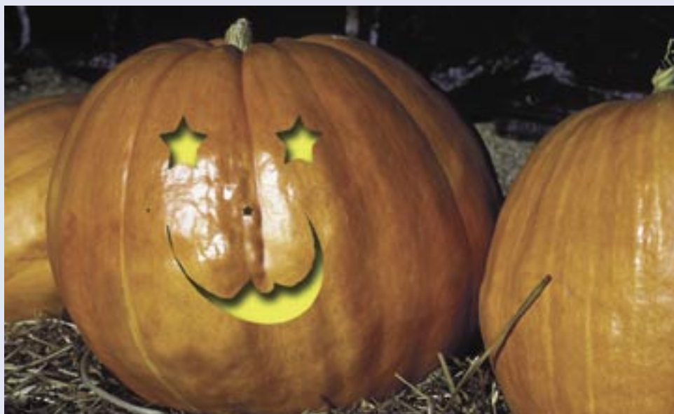
Don't miss out on the Pumpkin Cutting Competition at the Dark Tree Gallery on Friday October 31.