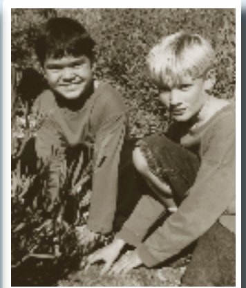
Turn back time: (L-R) Yanchep/Two Rocks community bus; 2002 Blessing of the Fleet; Children plant trees on the Marmion Ave extension.

OVER an extended period, Yanchep Sun City Pty Ltd (YSC) has received a great deal of input from Yanchep and Two Rocks residents about the values and aspirations of their communities. The consultation process has been so worthwhile that YSC now has plans to take it further, inviting community members to participate in the creation of a "community album".