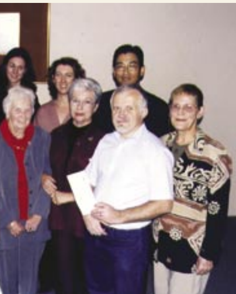
Applicants for YSC's sponsorship program.