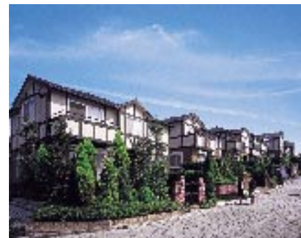
Some of Tokyu's urban development projects; Top: Mauna Lani in Hawaii; Above: Tama Garden City in Japan.

follow its company mission statement to "create a beautiful living environment, where each person can pursue individual happiness in a harmonious society" at Yanchep Sun City.